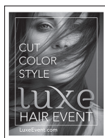
1/4 Page Layouts